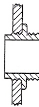
Outlet square and projecting into barrel coef. 0.70